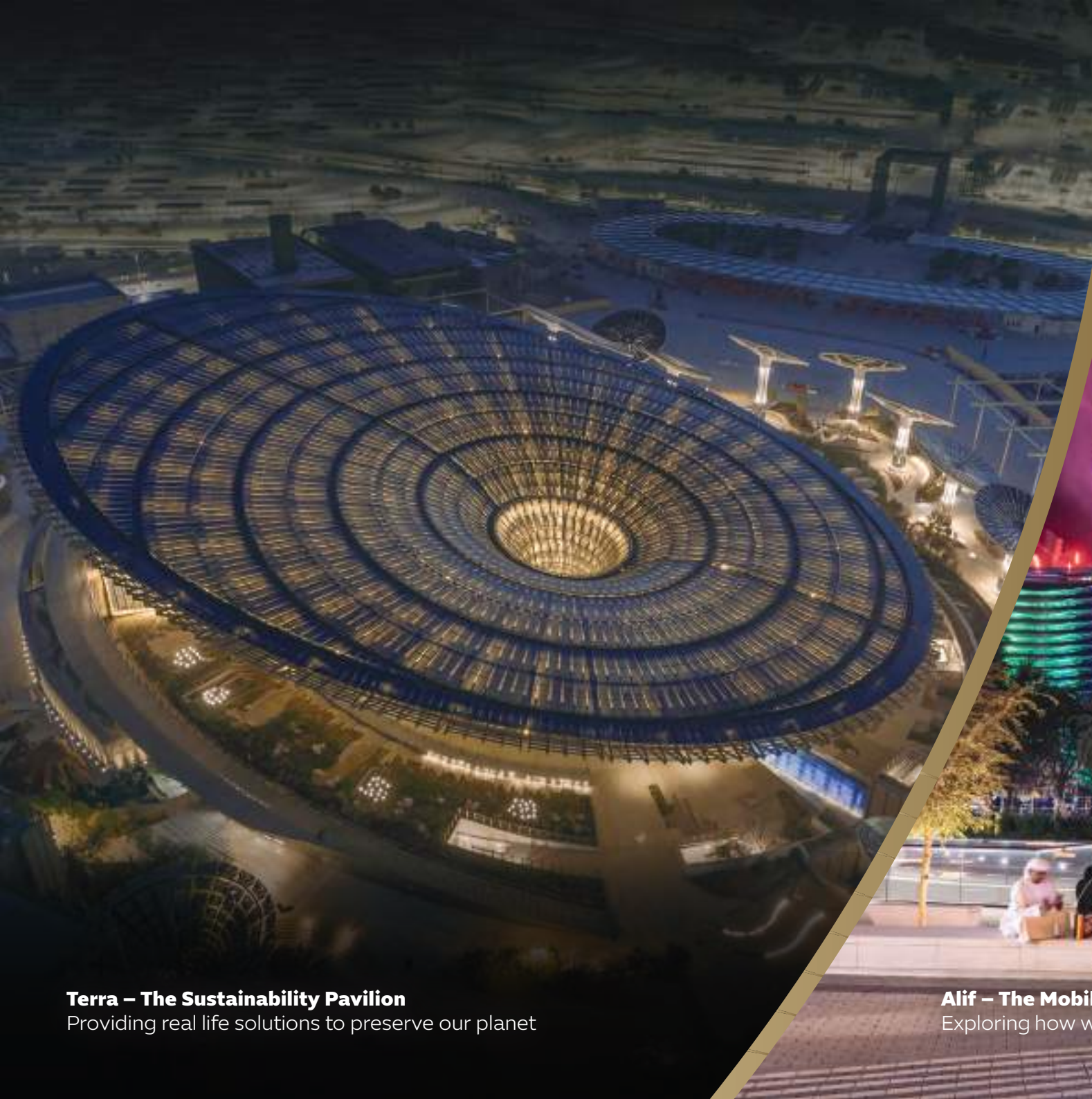
Terra – The Sustainability Pavilion Providing real life solutions to preserve our planet