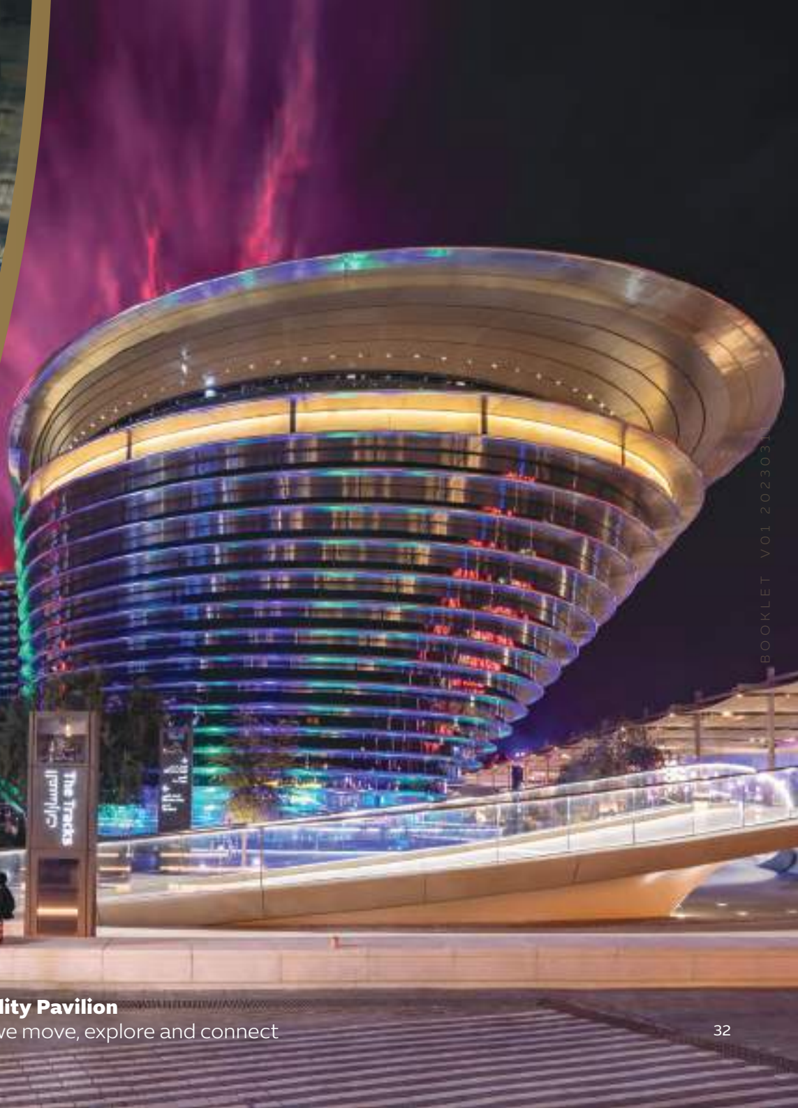
Alif – The Mobility Pavilion Exploring how we move, explore and connect